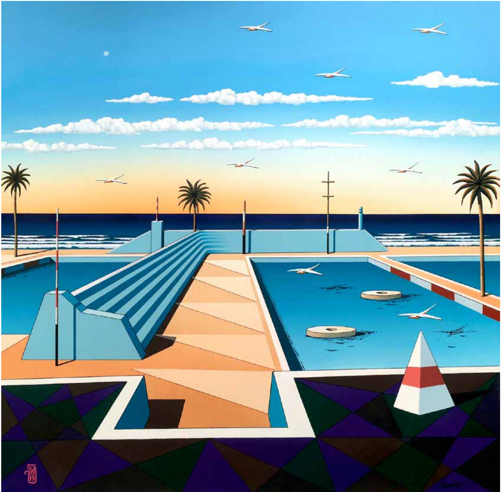
Almost the Edge of the Ocean

These were a suite of paintings entitled "Transplant Memories". This led in turn to an exploration of more geometric imagery related in particular to Archimedes' Puzzle and its numerous permutations. Pleased to be back